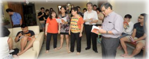
Impromptu caroling at a house-warming