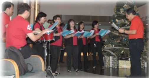
Quick rehearsal before the main event