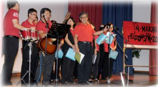
Performing at YMCA's Makan Fellowship 2015

Officially, the Dialect Team started Christmas Caroling on 16 Dec at the YMCA event but unofficially, they had an impromptu performance at a house-warming about a week earlier at a member's house.