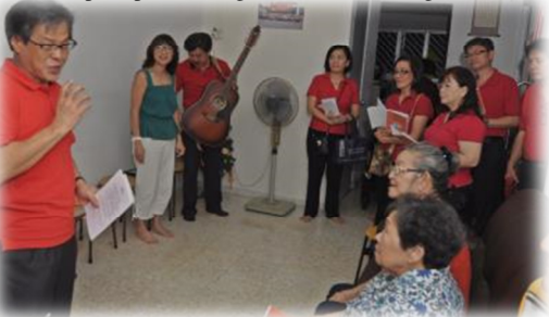
1 st home the Dialect Team visited in Jurong West

What are the basic minimum requirements to form a caroling team? Ideally, you should have at least one guitarist and about half a dozen singers. This configuration does not make you the best caroling team in town but it is sufficient if you have the heart to sing of the glories of Christmas.